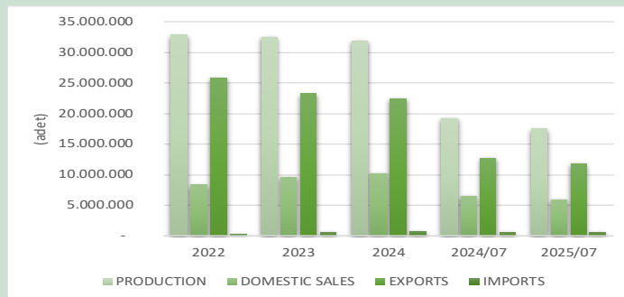
Figure 2: Data for 6 Main Products