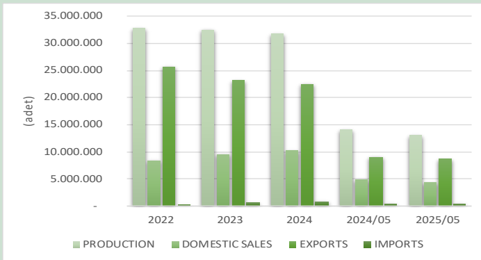
Figure 2: Data for 6 Main Products